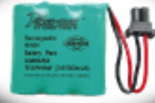
CP 3x2/3AAA (CP-2/3AAAx3) 3.6V 300 mAh Rechargeable Battery Type: NiMH