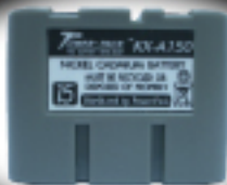
CP-KX-A150 (P-P341) 3.6V 300 mAh Rechargeable Battery Type: NiCD