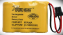
CP 3x2/3AA (KX-A36A, P-P301) 3.6V 300mAh Rechargeable Battery Type: NiCD