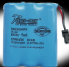
CP 3xAA (KX-A36, PP-501) 3.6V 700 mAh Rechargeable Battery Type: NiCD