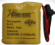
CP 2x2/3AA (CP-2/3AAx2, P-P305) 2.4V 300 mAh Rechargeable Battery Type: NiCD