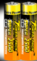
Special for DECT PHONE: AA 2500mAh Rechargeable Battery Type: NiMH